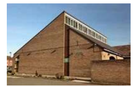
Our Lady & St Aidan